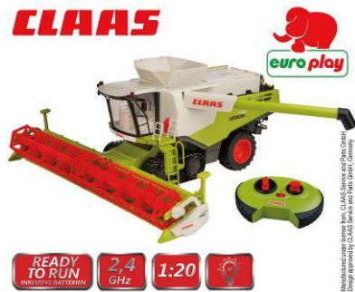
Illustration of article

Authorized representative Happy People GmbH & Co. KG Konsul-Smidt-Str 8b 28217 Bremen GERMANY