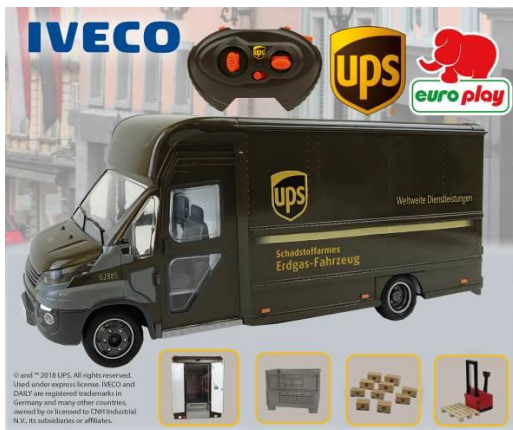
Illustration of article

Authorized representative Happy People GmbH & Co. KG Konsul-Smidt-Str 8b 28217 Bremen GERMANY